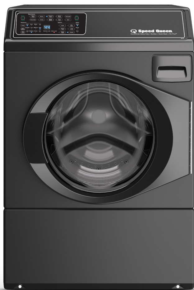
AFNE9B MB AFNE9BSP305AB99